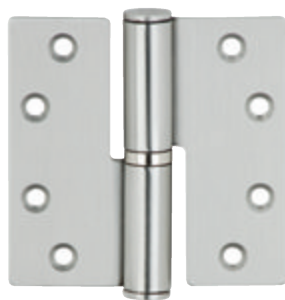
DIN right hand