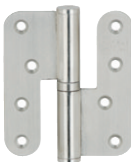
DIN left hand